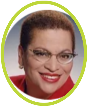
Dr. Julianne Malveaux GRAND MARSHALL